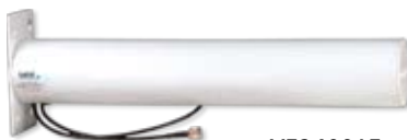
YE240015 Enclosed Yagi