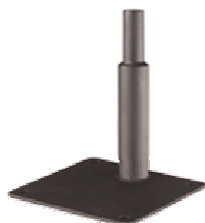
Model: 960-06 Mount Stand, 6" (127mm)

Click on any of the above images to find out more about the products pictured.