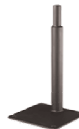
Model: 960-09 Mount Stand, 9" (203.2mm)

Website and content, copyright PanaVise Products, Inc. 1996 - 2011. PanaVise, PanaPress, PV Jr, Posi-Stop, Slimline, Slimline 2000, Uniflex, Stay-Put, PortaGrip, PortaGrip 2000, InDash, WindowGrip, Deluxe Multi Media Mount, Clip Caddy, and Vise Buddy are registered trademarks or trademarks of PanaVise Products, Inc. in the U.S. and in other countries. PanaVise's products are protected under one or more of the following U.S. Patents: 2,898,068; 3,661,376; 5,118,058; 5,187,744; 5,465,932; D390,849; D582,894. Patents pending on additional products in the U.S. and in other countries. PanaVise has a long history of vigorously prosecuting violations and/or protecting both its physical and intellectual property rights. All PanaVise Products are covered by a Limited Lifetime Warranty