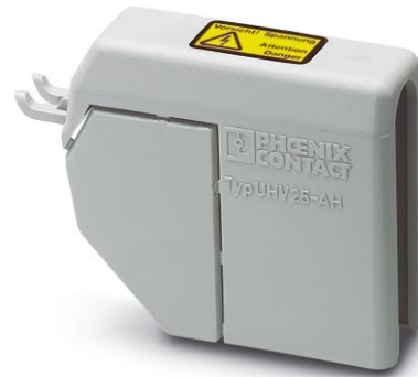
Illustration shows the product version UHV 25-AH

http://eshop.phoenixcontact.de/phoenix/treeViewClick.do?UID=2130460