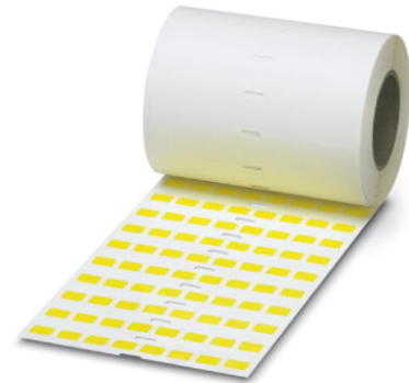
Illustration shows product version EML (20X8)R YE

http://eshop.phoenixcontact.de/phoenix/treeViewClick.do?UID=0816896