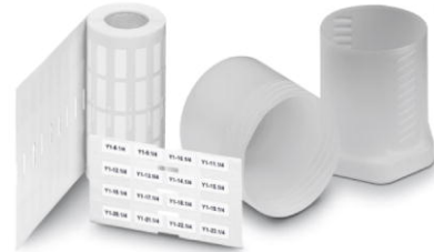
Illustration shows product version EML (20X8)R YE

http://eshop.phoenixcontact.de/phoenix/treeViewClick.do?UID=0817028