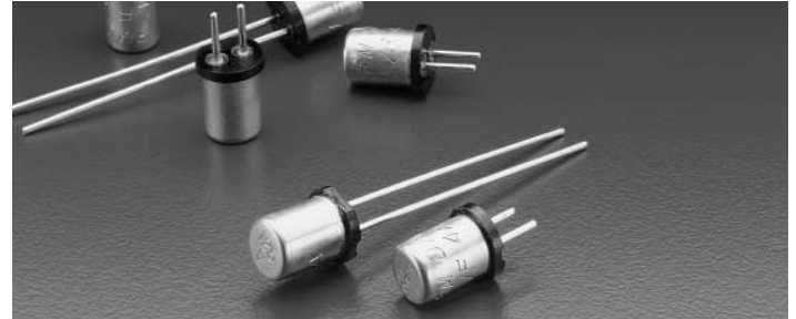
262 000 Series