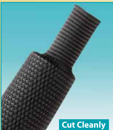
Cut Cleanly Scissor