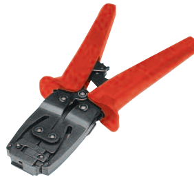
Universal Ferrule Crimper