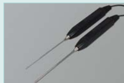
881603 and 881604 immersion probes