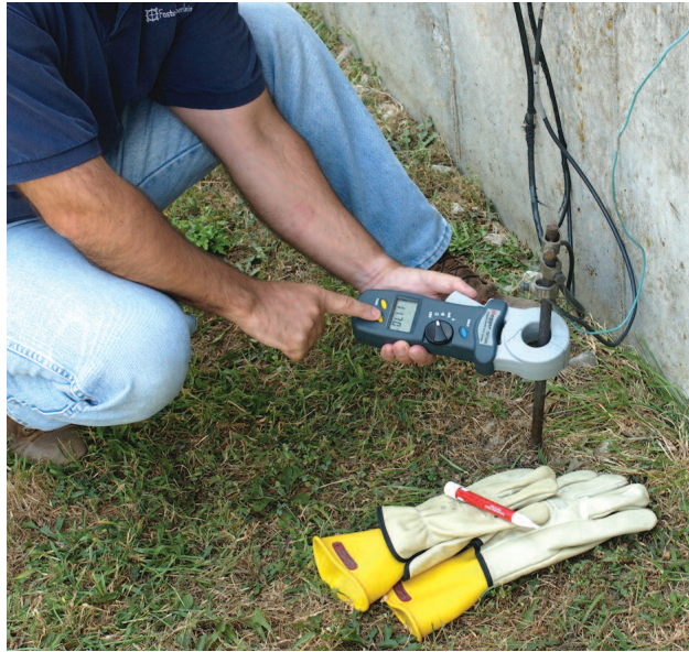
The DET20C instrument is shown being used to test a facility ground.