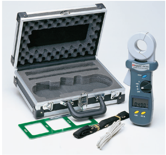
DET10C and 20C comes with a rugged carry case, calibration fixture, carry case shoulder strap and USB interface cable (DET20C only).