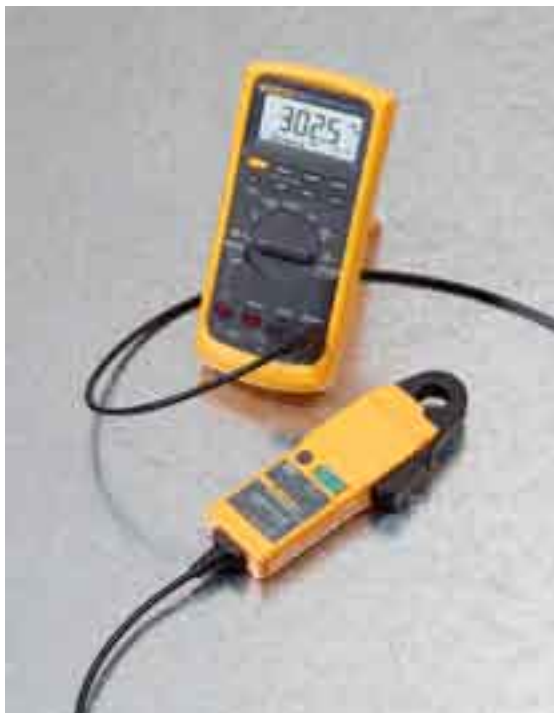
i30 connected to a Fluke 87V Digital Multimeter.

Fluke. Keeping your world up and running.