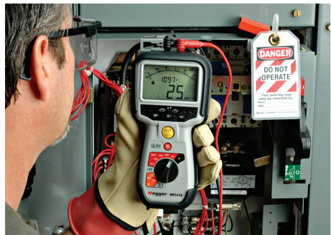
Panelboard testing is faster, easier and safer with the new MIT400 Series.