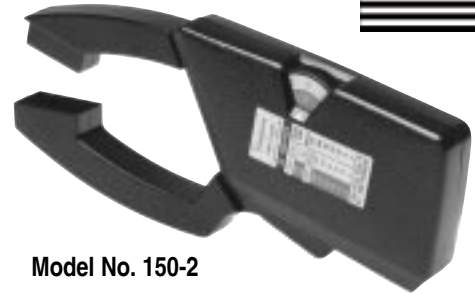
Model No. 150-2

Amp-Clamp current probes, used with analog VOMS provide accurate measurements of high AC current found in power systems and related control circuitry. The Amp-Clamp jaws are closed over a conductor in the circuit and the current load is indicated on the connected meter. The 150-2 has six ranges (up to 300 ACA) and is available with banana and reverse banana plugs.