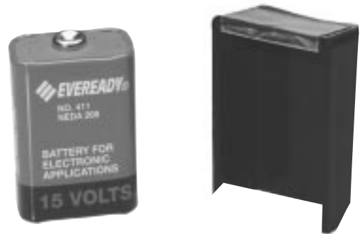
Model No. 45002