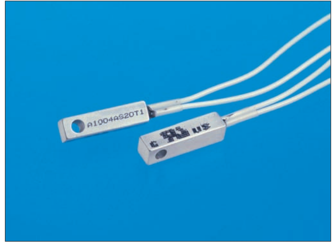
UL Listed Surface Temperature Sensor

SS&C assembly A1004AS20T1 is a general purpose thermistor probe for temperature sensing and is listed with Underwriters Laboratories (Certification file E193945). This sensor can be used to monitor air temperature or can be screw mounted for surface temperature measurement. The assembly consists of a highly stable NTC thermistor that is epoxied into an aluminum housing. The thermistor is a 10k\Omega thermistor with an accuracy of \pm 0.2^\circ\text{C} from 0^\circ\text{C} to 70^\circ\text{C} . The sensor leads are AWG#20, teflon insulated UL rated wire. Sleeving is used to provide strain relief and to guarantee the UL rated 400 volt isolation between the sensor and the housing. The assembly is UL rated for operation to 105^\circ\text{C} .