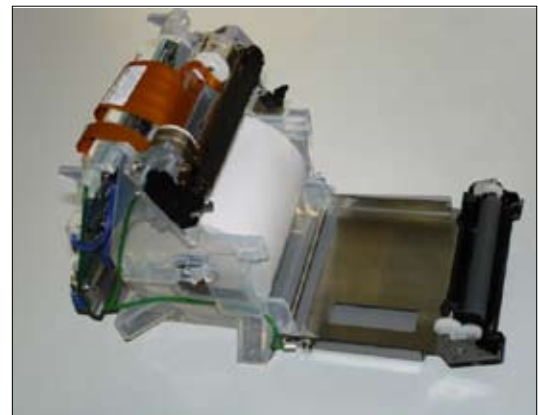
FTP-627USL401 platen/cutter open