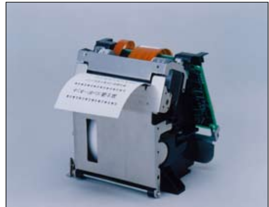
FTP-627USL401 platen/cutter closed