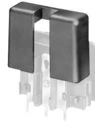
E.g. Rear cover for GSF1