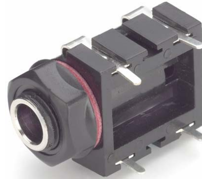
Model 7159 Horizontal 2-Conductor Jack, PC Board Mount