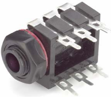
Model 7160 Horizontal 3-Conductor Jack, Solder Tabs