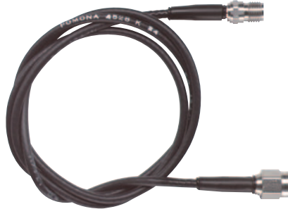
SMA (M) / SMZA(F) 50Ω Cable Assembly, 48in (1.2m) 4528