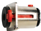
Panel Mount 1/4 Phone Jack, Locking 6877