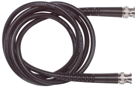
Rugged 75Ω BNC Plug / Plug, 6ft to 25ft (1.8m to 7.6m) 2249-E