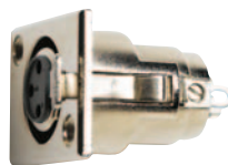
XLR (F) Panel Receptacle, 3 Contacts, Nickel-plated Zinc 5113A