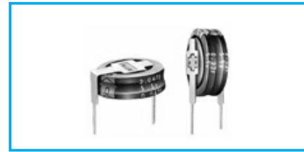
Marking color : White print on an indigo sleeve