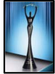
Electra Award 2005