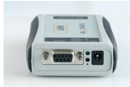
Side view: serial connector, power jack, mode select, SerialNET and power LEDs