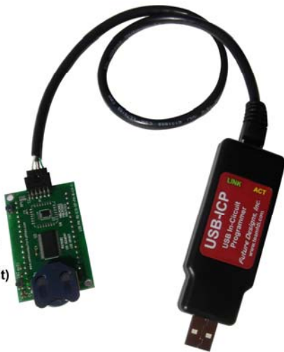
Example User Target Board (Not Part of Kit)

(Consult your specific device datasheet for details on ISP connectivity)