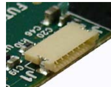
6-pin 1mm Header Mini-ISP