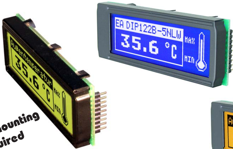
blue-white: EA DIP122B-5NLW Dimension 75 x 27 mm