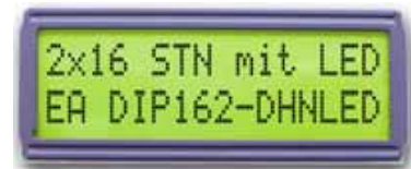
EA DIP162-DHNLED 68 x 27 x 11 mm