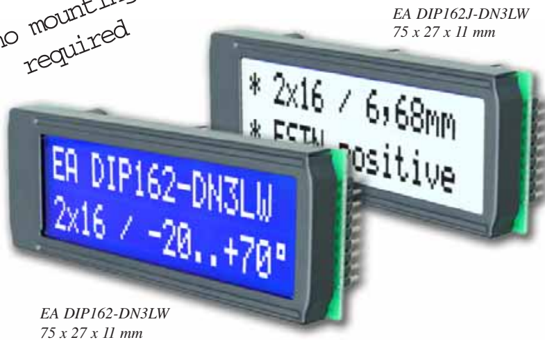
EA DIP162J-DN3LW 75 x 27 x 11 mm