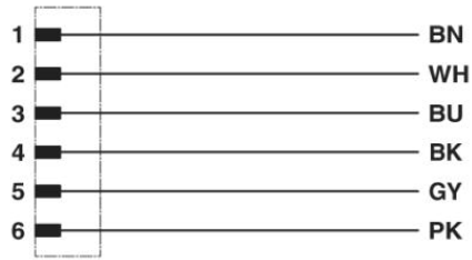
Contact assignment of the M8 plug