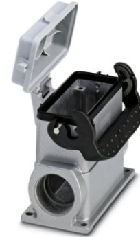
Photo shows product without screw connection

http://eshop.phoenixcontact.de/phoenix/treeViewClick.do?UID=1771176