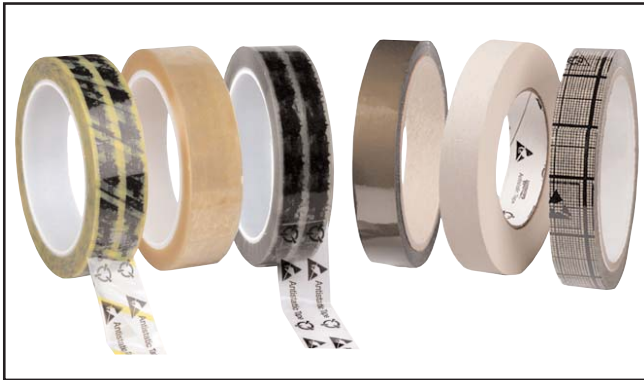
Wescorp Antistatic Tapes

In ESD protected areas, replace regular high charging tape with Wescorp Antistatic Tape. ANSI/ESD S20.20 paragraph 6.2.3.1. state "All nonessential insulators, such as those made of plastics and paper (e.g., coffee cups, food wrappers and personal items) must be removed from the workstation.