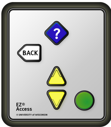
LAYOUT - 5 KEY