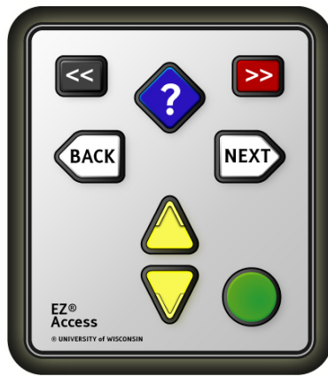
LAYOUT - 8 KEY