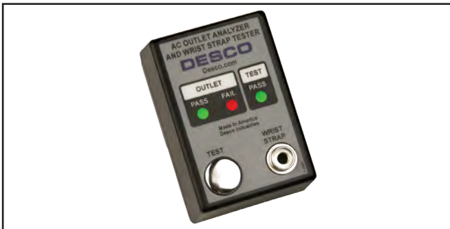
Figure 2. Desco 98131 AC Outlet Analyzer and Wrist Strap Tester