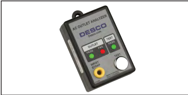
Figure 1. Desco 98130 AC Outlet Analyzer and Wrist Strap Tester