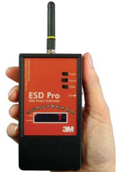
3M™ ESD Pro Event Detector, CTM082

Applications for the ESD Pro include electronics assembly, semiconductor device manufacturing, disk drive manufacturing, medical environments and military aerospace.