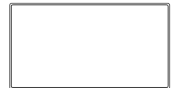
Steel wire perimeter reinforcing frame for extra strength and durability