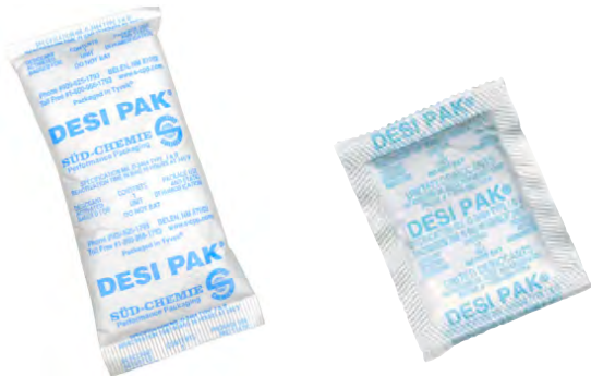
48887 & 48888

In order to provide a complete moisture barrier packaging assembly, desiccant must be inserted into the bag, prior to having the bag vacuum sealed. The recommended amount of desiccant is dependent on the interior surface area of the bag to be used. Figure 4 is a reference table indicating recommended minimum amounts of desiccant that should be used with Moisture Barrier Bags.