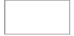
Steel wire perimeter reinforcing frame for extra strength and durability