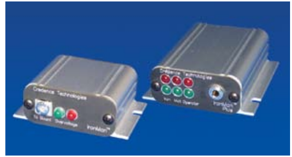
3M<sup>™</sup> Iron Man<sup>™</sup> and 3M<sup>™</sup> Iron Man<sup>™</sup> Plus Monitors