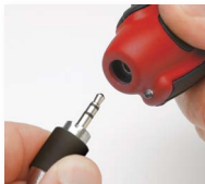
Easy and quick tip change-out with modular plug and rubberized sleeve