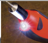
Bright LED illuminates the work, so it's easier to make perfect solder joints