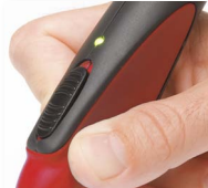
Red power-on LED turns green when iron reaches working temperature