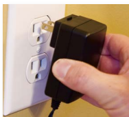
Patented power supply design helps give this iron outstanding performance