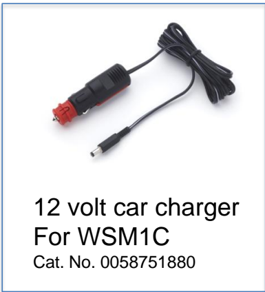
12 volt car charger For WSM1C Cat. No. 0058751880

Additional tip details available at www.cooperhandtools.com/weller RT-MIL tips are NOT compatible with WSM1 or WSM1C