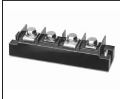
CM531220, CM531620 Dual SCR POW-R-BLOK™ Modules 200 Amperes/1200-1600 Volts