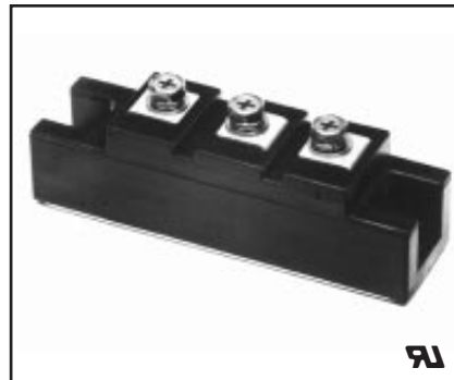
CDD10810 Dual Diode POW-R-BLOK™ Modules 100 Amperes/800 Volts