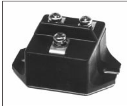
CN24_ _020N, CC24_ _020N Super Fast Recovery Dual Diode Modules 20 Amperes/300-600 Volts