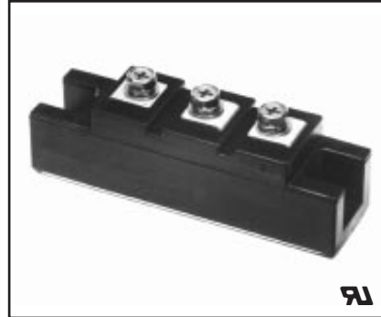
CD411260, CD411660 Dual Diode POW-R-BLOK™ Modules 60 Amperes/1200-1600 Volts