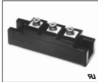
CD411230, CD411630 Dual Diode POW-R-BLOK™ Modules 30 Amperes/1200-1600 Volts