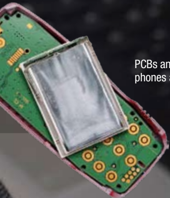
PCBs and components in mobile phones and wireless products

These solutions include an innovative line of 3M™ Electromagnetic Compatible Products (EMC) that are designed to control electromagnetic interference from internal sources, limit EMI susceptibility from external sources and help manufacturers meet high certification standards around the world.