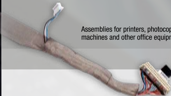
Assemblies for printers, photocopiers, facsimile machines and other office equipment