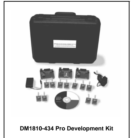
DM1810-434 Pro Development Kit

The DM1800-434 Quick Kits contain the following: