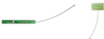
Vertical Polarization Position*