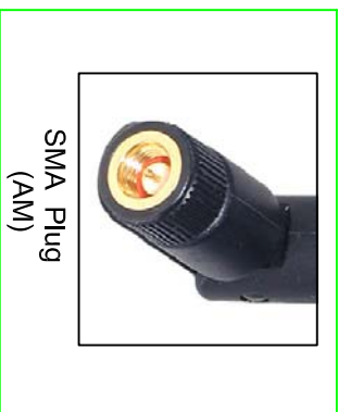
SMA Plug (AM)