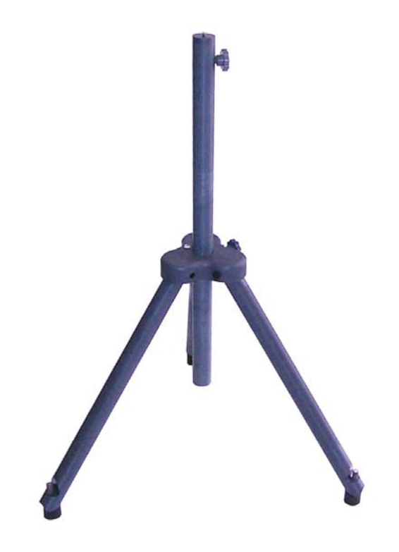
The TDK RF Solutions TRI-150R Tripod is specifically designed for EMC test environments and can support up to 45 kg.