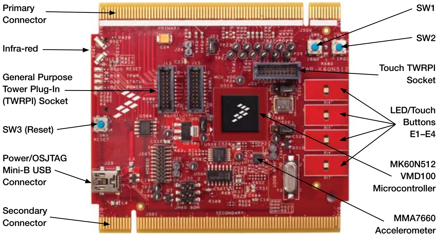
Figure 1: Front Side of TWR-K60N512 Module Not Including TWRPI.