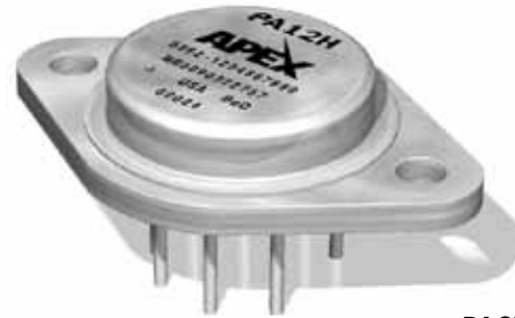
8-PIN TO-3 PACKAGE STYLE CE

These hybrid integrated circuits utilize thick film conductors, ceramic capacitors and silicon semiconductors to maximize reliability, minimize size and give top performance. Ultrasonically bonded aluminum wires provide reliable interconnections at all operating temperatures. The 8-pin TO-3 package (see Package Outlines) is hermetically sealed and isolated. The use of compressible thermal washers and/or improper mounting torque will void the product warranty. Please see "General Operating Considerations".