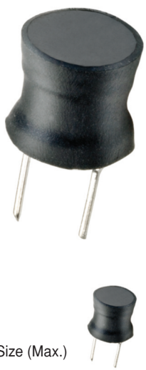
Actual Size (Max.)