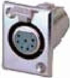
Model 6854 XLR (F) 5-pin rectangular flanged mount

Protect contacts and absorb vibrations in your audio applications.